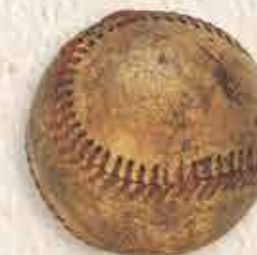
The first professional baseball game was played in Fort Wayne on May 4, 1871

*CONSUMING RAW OR UNDERCOOKED MEATS, POULTRY, SEAFOOD, SHELLFISH OR EGGS MAY INCREASE YOUR RISK OF FOODBORNE ILLNESS.