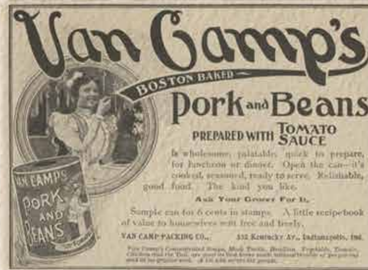
Indianapolis grocer Gilbert Van Camp opened up a canning company and Van Camp's Pork and Beans became an American staple.

BOURBON-MAPLE BACKYARD BBQ SPICE RED HOT