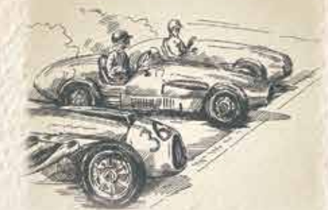
The Indianapolis 500 was inaugurated in 1911