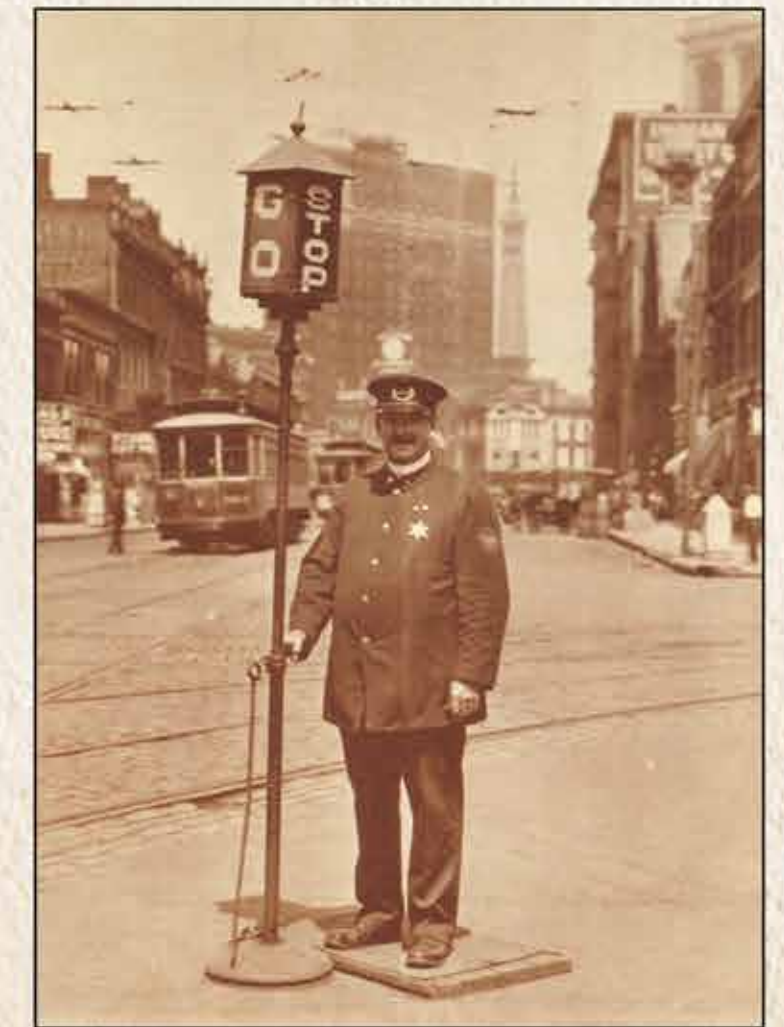
Indianapolis Traffic Director of 1918