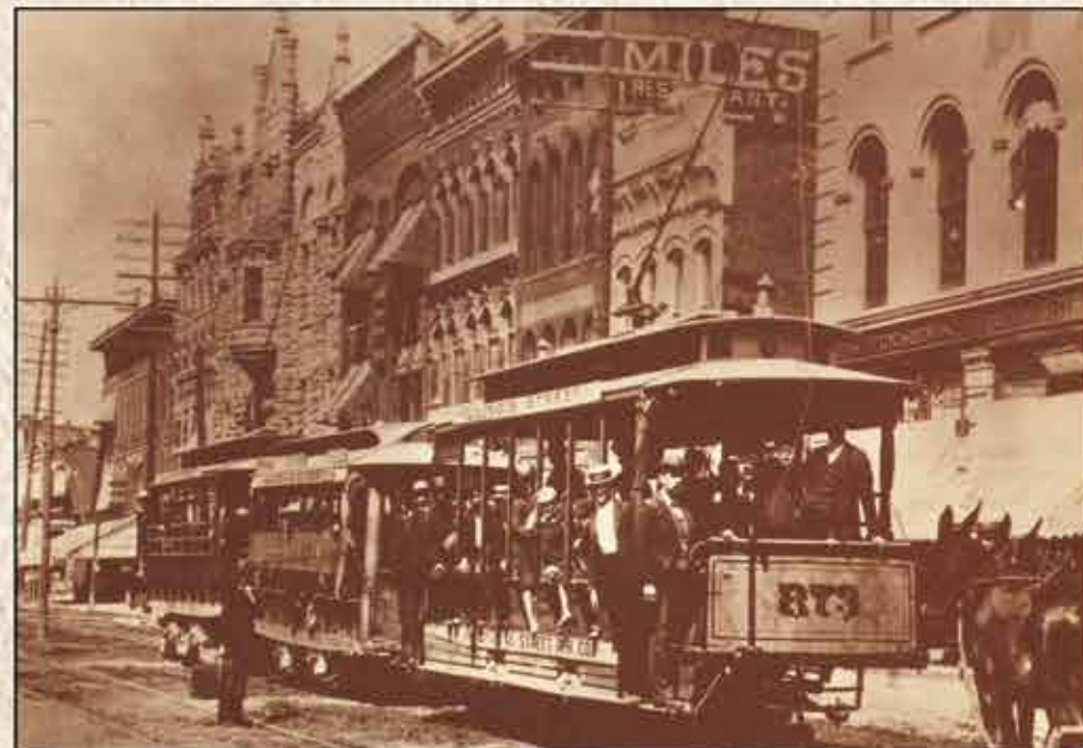
Indianapolis trolley car at the turn of the century - courtesy of The Indianapolis Public Library Postcard Collection