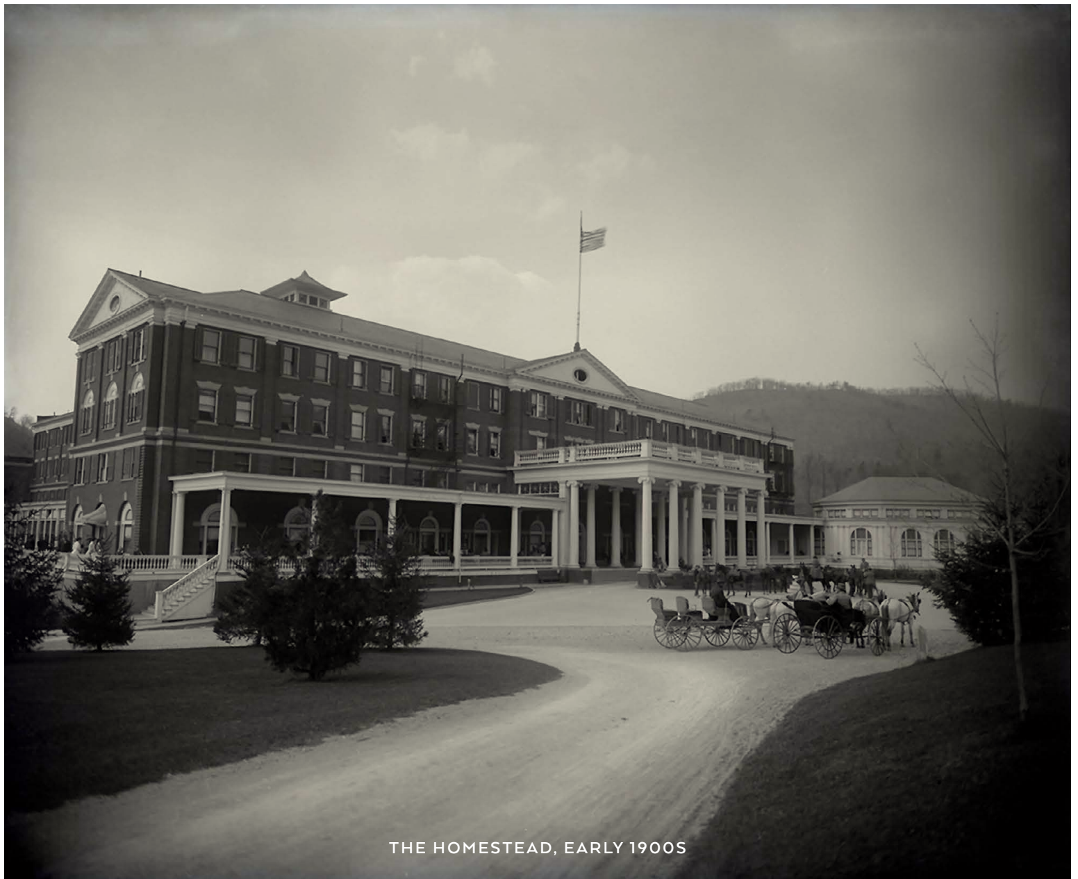
THE HOMESTEAD, EARLY 1900S