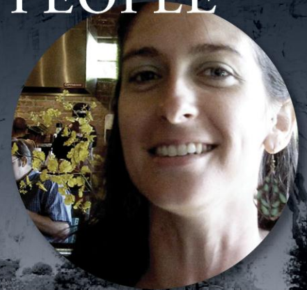
The Ahwahnee YOSEMITE NATIONAL PARK, CALIFORNIA