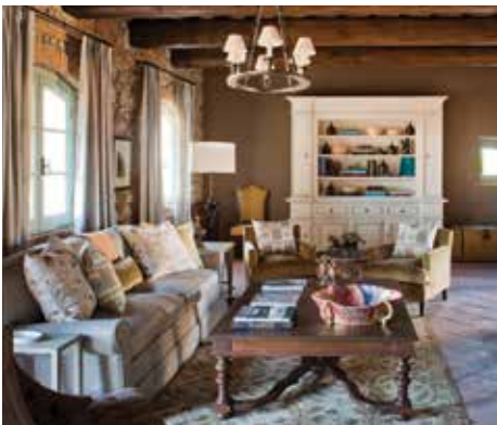
Castello di Casole Casole d'Elsa/Tuscany, Italy

A range of expansive suites offer stone fireplaces, spacious bedrooms and living rooms, private terraces, and stunning Alps views at this exclusive resort overlooking the charming town of Gstaad. The Panorama Suite is a spectacular three-bedroom duplex with a full kitchen, a private spa, a fitness area, and breathtaking views in every direction.