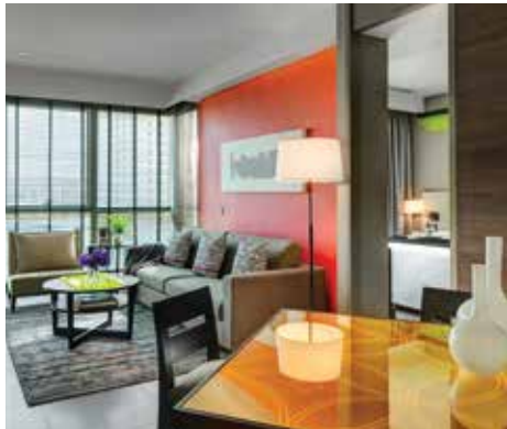
klapsons The River Residences Bangkok Bangkok, Thailand