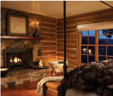
The Lodge & Spa at Brush Creek Ranch Saratoga, Wyoming, USA