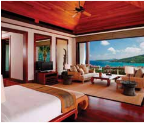
Andara Resort & Villas Phuket, Thailand