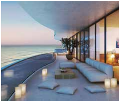
Hyde Resort & Residences Hollywood, Florida, USA