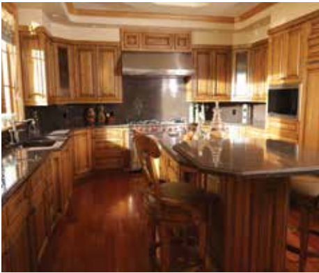
The Broadmoor Colorado Springs, Colorado, USA