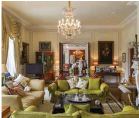
The K Club Straffan, Ireland