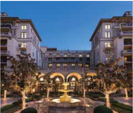
Montage Beverly Hills Beverly Hills, California, USA

Set around a village green in the heart of The K Club estate, the luxurious three-bedroom villas offer gorgeous lake and golf course views. All residences feature traditional 19th-century French design, state-of-the-art comforts, and warm Irish hospitality. Guests have access to the services and activities The K Club offers, including fishing, golfing, and spa privileges.