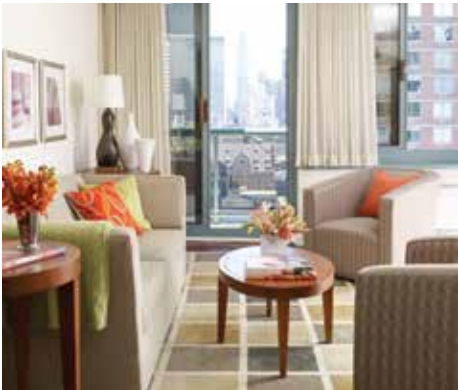
AKA United Nations New York, New York, USA