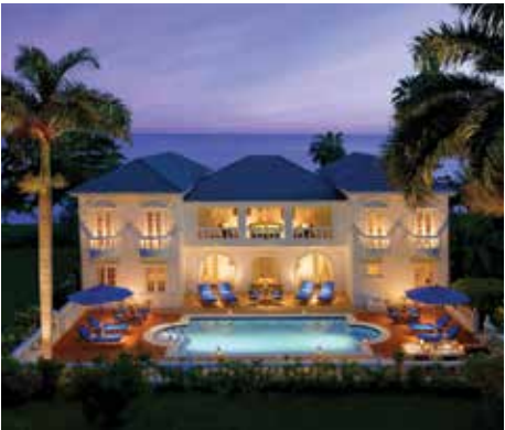
Half Moon Montego Bay, St. James, Jamaica

Each elegantly appointed suite offers luxurious amenities, ornate design features, lavish interiors, and magnificent city, garden, or Bosphorus views. Residents can unwind in the luxurious spa, or dine at one of the hotel's six restaurants, including a patisserie and a lounge. Historic squares, prominent boulevards, and majestic mosques are just steps from CVK Park Bosphorus Hotel.