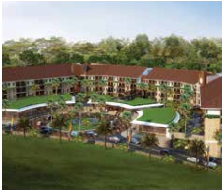
Grand Summit Pecatu Serviced Residences, Bali Bali, Indonesia