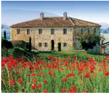
Castello di Casole Casole d'Elsa/Tuscany, Italy