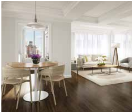
AKA Sutton Place New York, New York, USA