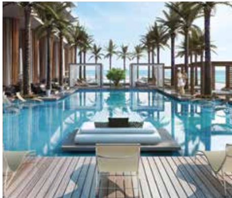
Hyde Resort & Residences Hollywood, Florida, USA