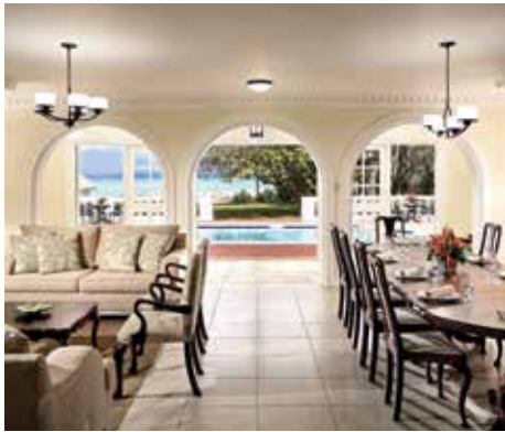
Half Moon Montego Bay, St. James, Jamaica

Life's greatest pleasures are found in a countryside farmhouse brimming with history in Tuscany's rolling green hills. Each intimate, self-contained home is constructed from antique stones and bricks, and can accommodate 8 to 12 guests. The traditional architecture juxtaposes with modern furnishings – from luxurious infinity pools, to impressive baths, and outdoor spaces perfect for entertaining.