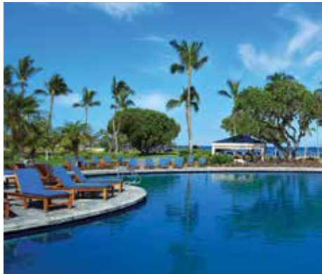
Mauna Lani Bay Hotel & Bungalows Kohala Coast, Hawaii, USA