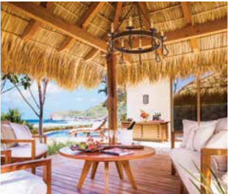
Mukul BEACH, GOLF & SPA Guacalito de La Isla, Nicaragua

These expansive, luxurious bungalows offer breathtaking ocean views and are ideal for longer stays on the Big Island. The interior draws inspiration from the its surroundings with warm tones of burnt orange and yellow, reminiscent of the Kohala Coast sunsets seen from the bungalows’ outdoor lanais. Special touches include private pools, Jacuzzis, BBQs, and private tropical gardens with a rain shower.