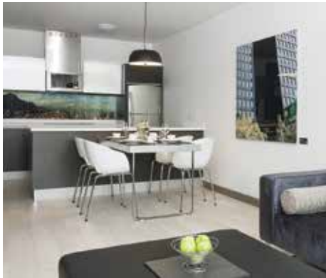
Hotel bs Kiü Bogotá, Colombia

AKA White House consists of spacious, well-appointed residences with king-size beds, marble bathrooms with glass shower doors, elegant living rooms, and full kitchens, as well as a Technogym fitness center and a business center. The lobby and living room-like lounge are ideal areas to enjoy a coffee in the morning or a cocktail at the end of a long day.