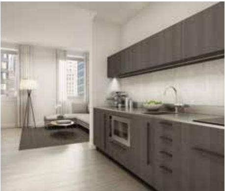
AKA Wall Street New York, New York, USA

In one of New York City’s most exclusive and prestigious neighborhoods, AKA Sutton Place provides a respite from the bustle of midtown Manhattan. These luxurious apartments provide the privacy of a comfortably appointed residence with select hotel amenities, including a large heated indoor swimming pool, a Technogym fitness center, and a business center.