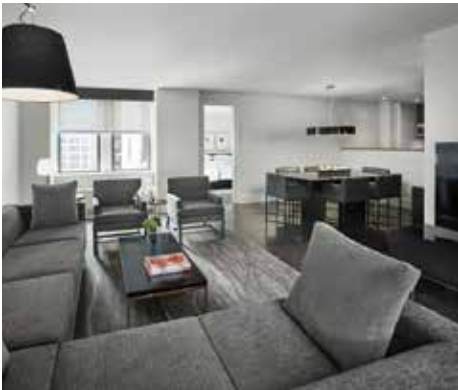
AKA Central Park New York, New York, USA