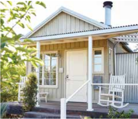
Carneros Resort & Spa Napa, California, USA