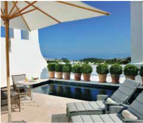
Finca Cortesín Hotel, Golf & Spa Costa del Sol/Casares, Spain