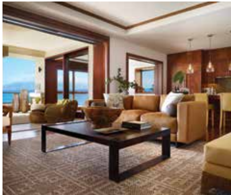
Montage Kapalua Bay Lahaina, Maui, Hawaii, USA