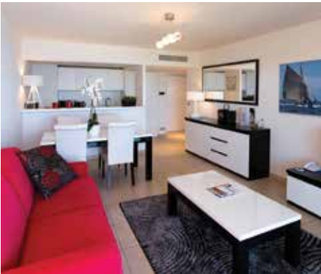
Royal Antibes Antibes, France