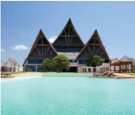
Essque Zalu Zanzibar Zanzibar, Tanzania