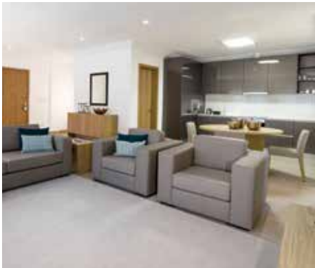
Fiesta Residences Accra, Ghana