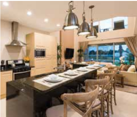
Magic Village Resort Orlando, Florida, USA