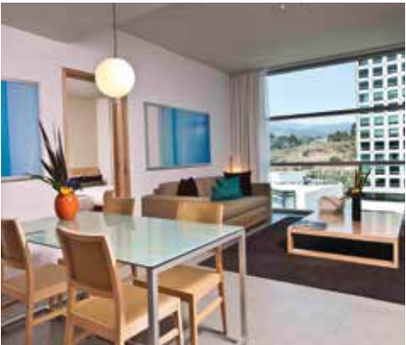
Stadia Suites Santa Fe Mexico City, Mexico

Bringing together sophistication and sensuality, Hyde Resort & Residences offers a true tropical getaway in south Florida. Private terraces, light-filled open floor plans, and floor-to-ceiling windows bring breathtaking ocean views to every residence, while the interiors are well appointed with modern amenities, gourmet kitchens, and high-end décor. Within the resort, residents have access to private cabanas, two infinity-edge pools, a sundeck, and a spa and fitness center.