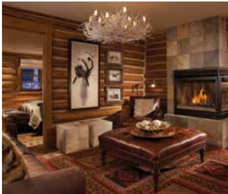
The Lodge & Spa at Brush Creek Ranch Saratoga, Wyoming, USA