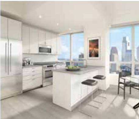
AKA University City Philadelphia, Pennsylvania, USA