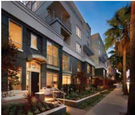
AKA Beverly Hills Beverly Hills, California, USA