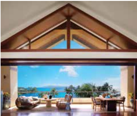
Montage Kapalua Bay Lahaina, Maui, Hawaii, USA