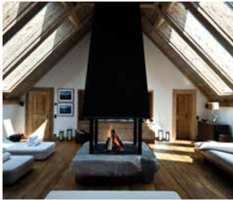
The Alpina Gstaad Gstaad, Switzerland