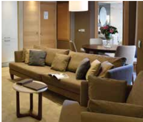
CVK Park Bosphorus Hotel Istanbul, Turkey