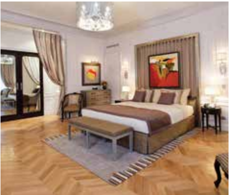
Majestic Hotel-Spa Paris Paris, France