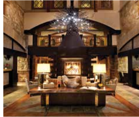
The Sebastian — Vail Vail, Colorado, USA