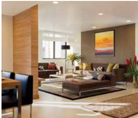
8 on Claymore Serviced Residences Singapore