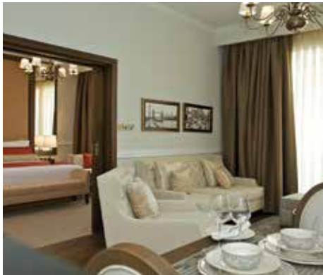
DUKES Dubai Dubai, UAE