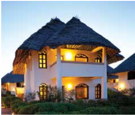
Essque Zalu Zanzibar Zanzibar, Tanzania