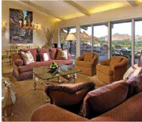
Sanctuary on Camelback Mountain Resort and Spa Scottsdale, Arizona, USA