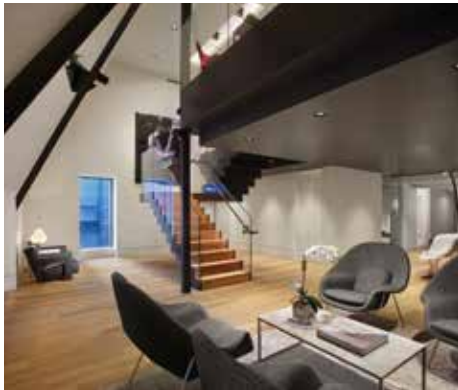
AKA Times Square New York, New York, USA