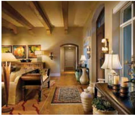
Sanctuary on Camelback Mountain Resort and Spa Scottsdale, Arizona, USA