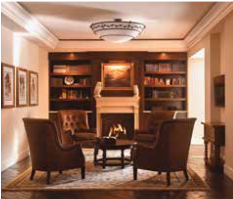
Montage Deer Valley Park City, Utah, USA