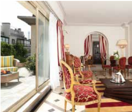
Majestic Hotel-Spa Paris Paris, France