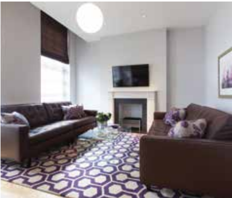
AKA Marylebone London, England, UK