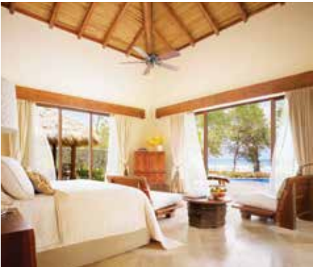
Mukul BEACH, GOLF & SPA Guacalito de La Isla, Nicaragua