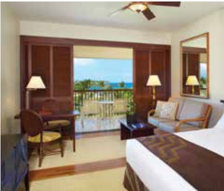
Mauna Lani Bay Hotel & Bungalows Kohala Coast, Hawaii, USA