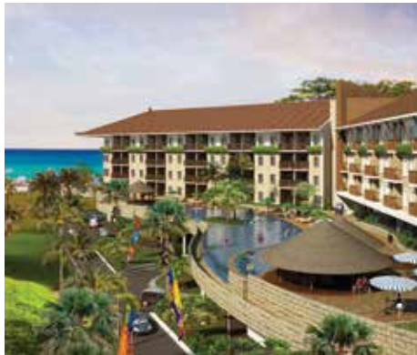
Grand Summit Pecatu Serviced Residences, Bali Bali, Indonesia