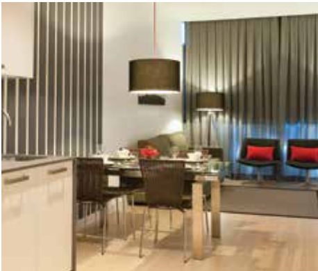
MH Apartments Barcelona Barcelona, Spain