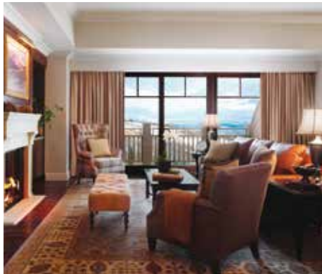
Montage Deer Valley Park City, Utah, USA