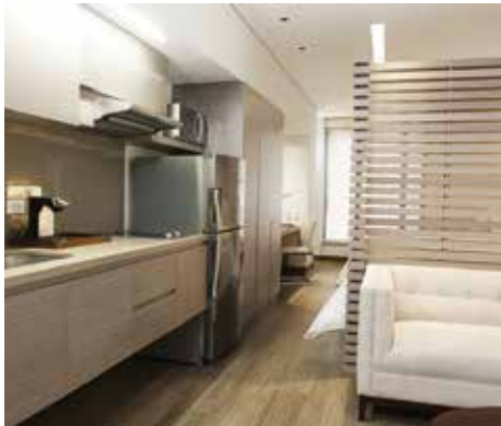
bs Rosales Hotel & Suites Bogotá, Colombia