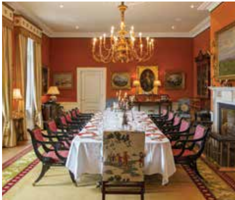
The K Club Straffan, Ireland