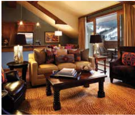
The Sebastian — Vail Vail, Colorado, USA

Distinctively decorated and luxuriously furnished, these mountainside residences deliver the utmost in privacy, breathtaking views, and expansive living spaces. Each luxury home is ideal for a relaxing retreat, offering unique amenities such as a billiard room, multi-level decks, secluded pools, whirlpools, patios, a dry sauna, and a private workout room and tennis court.