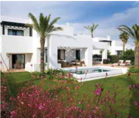
Finca Cortesín Hotel, Golf & Spa Costa del Sol/Casares, Spain