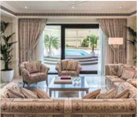
Palazzo Versace Residence Dubai, UAE

Located on the upper six floors of the exclusive Montage Deer Valley resort, these condominium residences provide the perfect combination of comfort and convenience. Each varies in size and layout, but all provide spacious kitchens and living rooms, gas fireplaces, full washer and dryer, natural materials including rich woods and warm stone surfaces, and spectacular mountain and valley views.