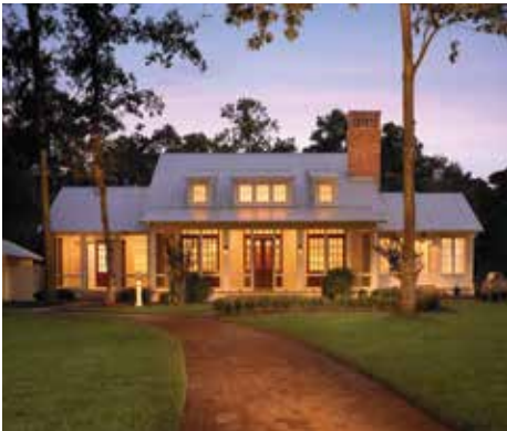
Montage Palmetto Bluff Bluffton, South Carolina, USA