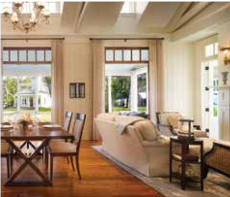
Montage Palmetto Bluff Bluffton, South Carolina, USA