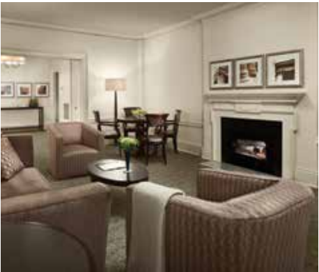
AKA Rittenhouse Square Philadelphia, Pennsylvania, USA

Redefining contemporary urban living, these chic and functional residences feature clean architectural lines and a neutral palette to evoke comfort and tranquility above Singapore's vibrant streets. Modern amenities and services include complimentary WiFi, Nespresso™ coffee machine, modern kitchen appliances, washer and dryer, 24-hour room service, and housekeeping.