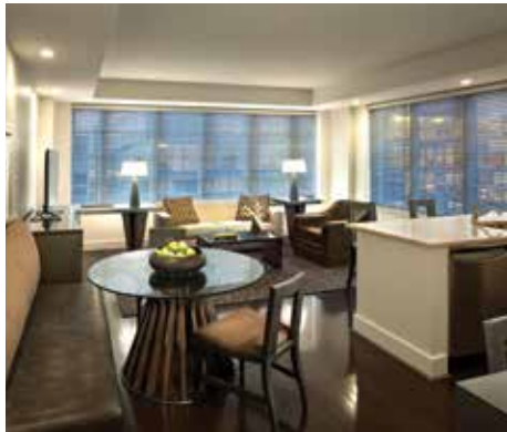
AKA White House Washington, District of Columbia, USA