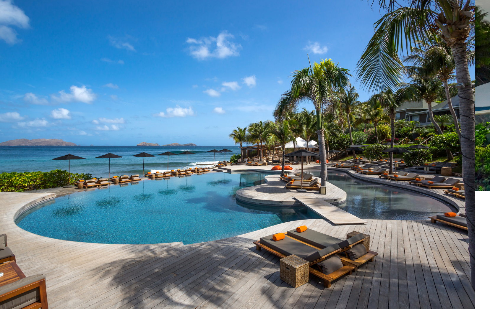
ST. BARTS Hotel Christopher, A member of Preferred Hotels & Resorts

As a trendy playground for the rich and famous, St. Barts is probably on your vacation bucket list. Favored for its French culture in the middle of the Caribbean, savvy jetsetters flock to St. Barts for its white-sand beaches, which seem to melt into the clear water and are dotted with chic hotels. The quaint and remote Hotel Christopher is a no-brainer, with ocean-view rooms and a location of the prestigious Sisley spa. You may end up dining here every night because their Taïno restaurant provides one of the best views on the island, an appetizing menu, and inventive cocktails. But do take time to tear yourself away from the hotel, as a day in Gustavia, the island's capital, will procure a dazzling view of luxury yachts and designer boutiques. hotelchristopher.com