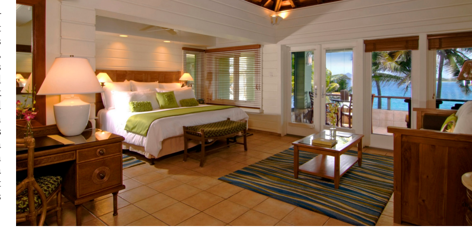
NEVIS Montpelier Plantation & Beach

If you want to get lost in the Caribbean without going into survival mode, head to Nevis—where the vibe is soothing and secluded, you'll find long stretches of empty beaches, and the scenery is a Technicolor fantasy. The small, almost perfectly round island inhabits just one main road that has been used for centuries, a rainforest within the clouds, and old plantation ruins. Hideaway at The Montpelier Plantation & Beach, a 19-room boutique hotel set in an 18<sup>th</sup>century sugar plantation surrounded by 60 acres of lush gardens. The property's open design was planned to allow guests to move between the rooms and the outside so that they can feel connected to the rich blues and greens of the island. Each guestroom is individually decorated offering the sense of a beach house, yet the Relais & Chateaux hotel branding provides upscale attention and details.