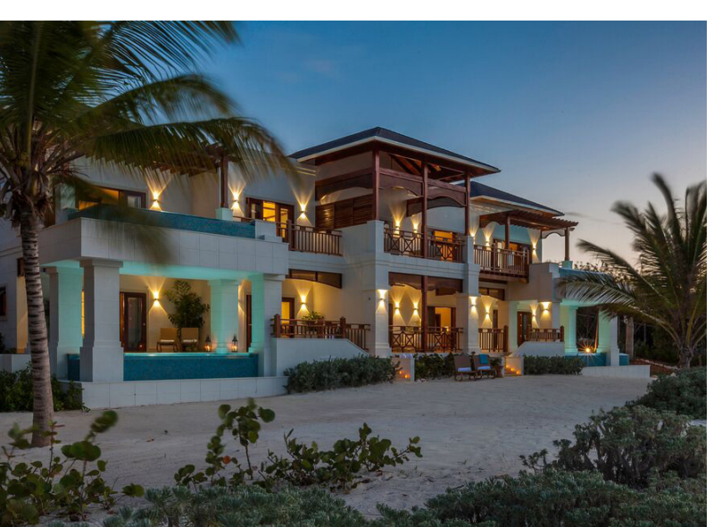
ANGUILLA Zemi Beach House Resort & Spa, A member of Preferred Hotels & Resorts

As a trendy playground for the rich and famous, St. Barts is probably on your vacation bucket list. Favored for its French culture in the middle of the Caribbean, savvy jetsetters flock to St. Barts for its white-sand beaches, which seem to melt into the clear water and are dotted with chic hotels. The quaint and remote Hotel Christopher is a no-brainer, with ocean-view rooms and a location of the prestigious Sisley spa. You may end up dining here every night because their Taïno restaurant provides one of the best views on the island, an appetizing menu, and inventive cocktails. But do take time to tear yourself away from the hotel, as a day in Gustavia, the island's capital, will procure a dazzling view of luxury yachts and designer boutiques. hotelchristopher.com