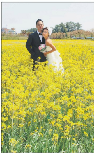
BRIDAL BLOOMS: A field of buttercups in the Jeju countryside lends colour to the writer's wedding shots.