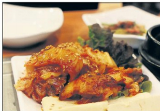
YUMMY: Savoury beancurd, a staple dish, served in a beancurd restaurant on the O'ngo food-tour route.