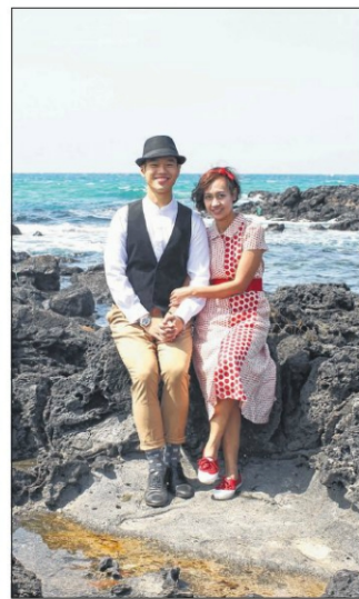
SAY CHEESE: The cobalt-blue beaches in the Jeju countryside, an hour's flight from Seoul, make for a colourful backdrop.