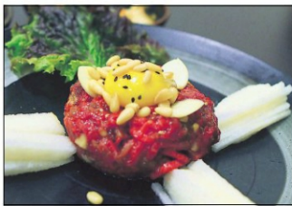
KOREAN TAKE: The Korean version of steak tartare is savoury Yukhoe, infused with sesame oil and thin pear slices.