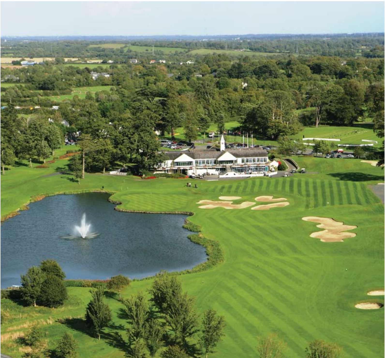
Right: The 18th hole on The Palmer Ryder Cup course