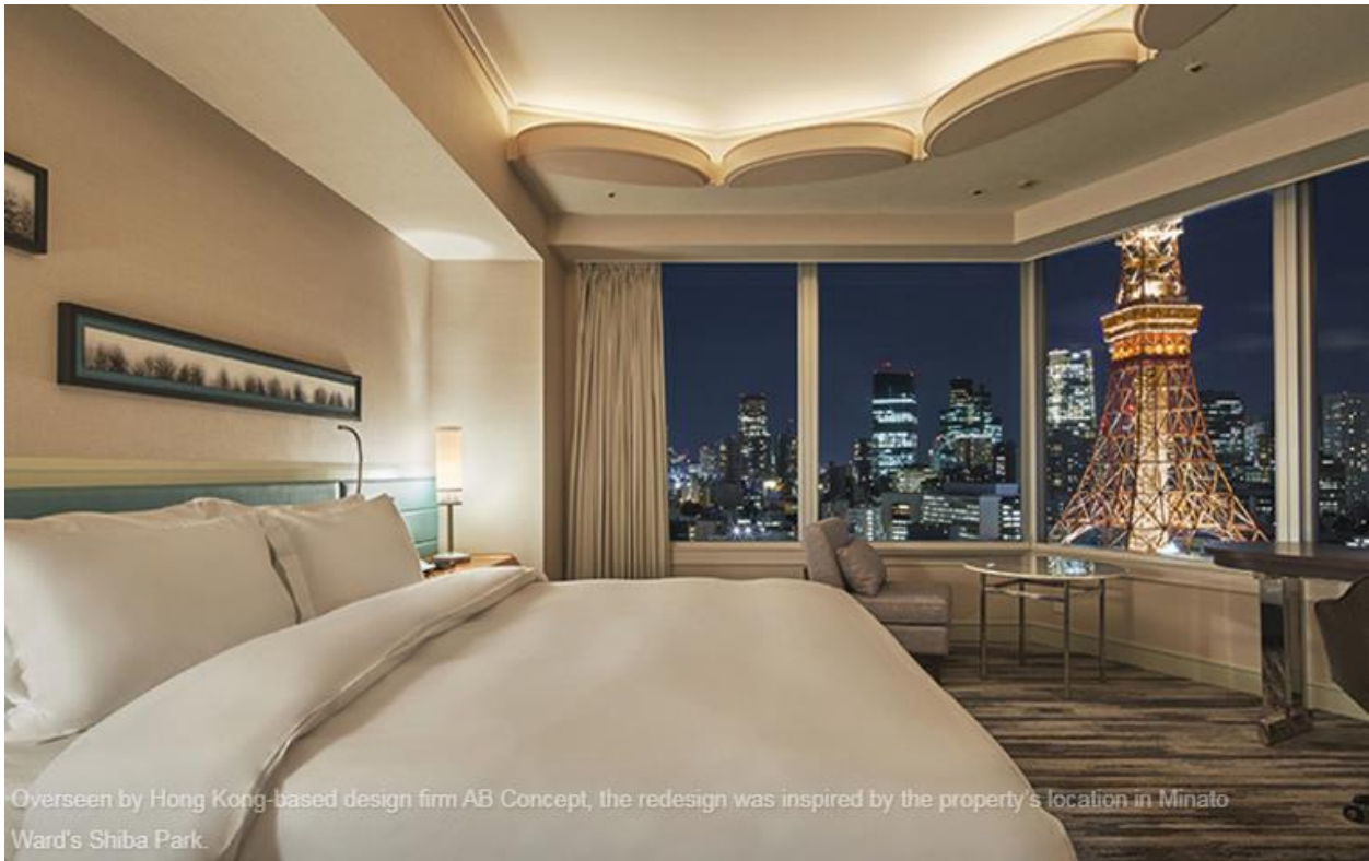
Overseen by Hong Kong-based design firm AB Concept, the redesign was inspired by the property's location in Minato Ward's Shiba Park.