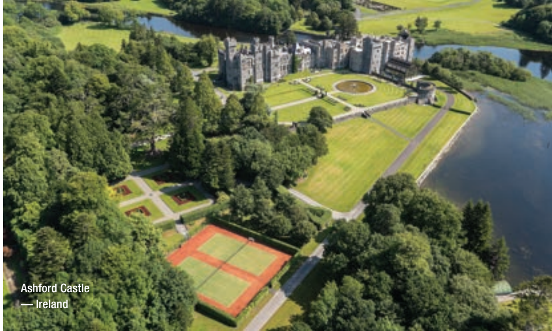
Ashford Castle — Ireland