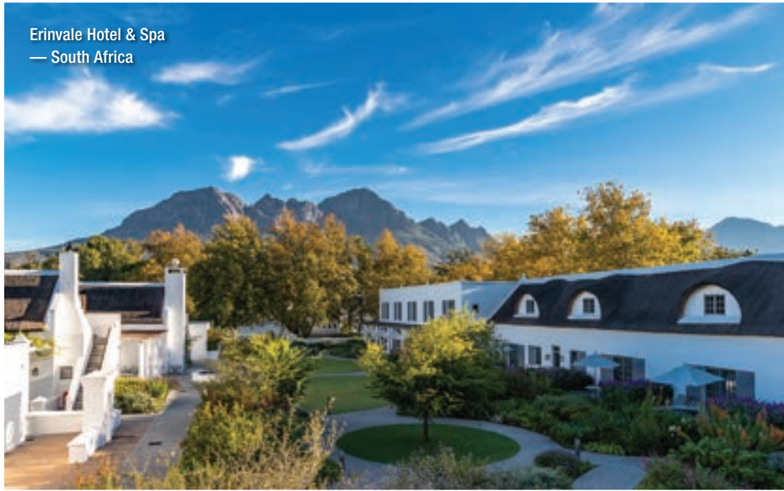
Erinvale Hotel & Spa — South Africa