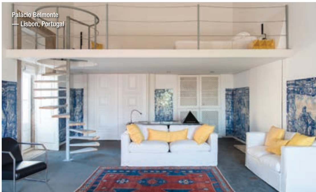
Palácio Belmonte — Lisbon, Portugal