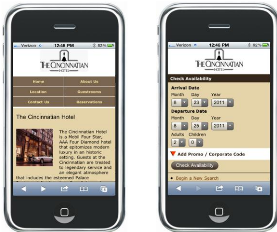
Basic Mobile Website

a la carte pricing available for booking engine or website only.