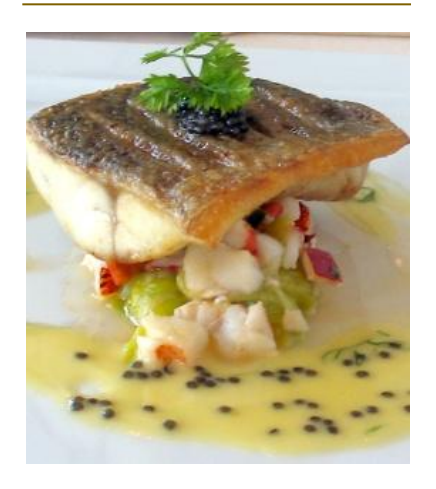
price is per person

grilled new york strip accompanied by cabernet whipped potatoes, the grand twelve vegetable medley with a roasted shallot demi-glace