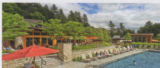
The height of luxury: Topnotch's fire pit overlooks Mount Mansfield; one of its two outdoor pools with mountain views (above)

THESE days, we choose our hotel rooms like we order our coffee. And in the case of the Topnotch Resort in Vermont, the beautiful state that borders New York and New Hampshire, your skinny mocha flat white double-shot triple bypass is room 323, the third-floor mini suite with the vaulted ceiling, the slatted blinds and the verdant view. While staying at the Topnotch – which has a kind of East Coast Calistoga vibe – you should check out the local town Stowe, too, which has a great selection of bars and restaurants – including Plate – whose staff all seem to subscribe to the “Yes, we are actually delighted to see some paying customers” school of service. If you want to be charmed into thinking that you never want to go anywhere on holiday other than North America, then Stowe is as good a place to start as any. And while the area is famous for its exhaustive fascination with independently produced ales, frankly there are few better places to spend the summer in Vermont than sipping a Corona on the Topnotch terrace. ☞ Topnotch Resort in Stowe, Vermont, is a member of the Preferred Hotels & Resorts LVX Collection. Rates start from £115 in November. topnotchresort.com , preferredhotels.com