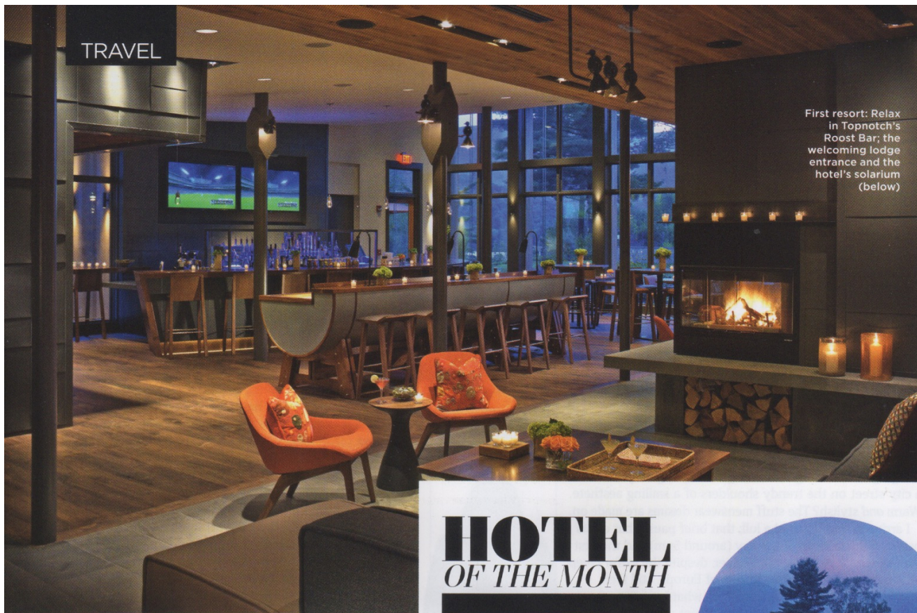
First resort: Relax in Topnotch's Roost Bar; the welcoming lodge entrance and the hotel's solarium (below)