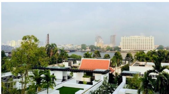
View from top floor Riverview Suite of The Siam Residence Building