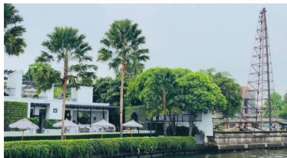
View from The Siam Pier showing crane adjacent to The Siam Pool and Riverview Pool Villa