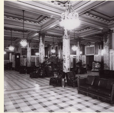
Hotel Monteleone (1886)