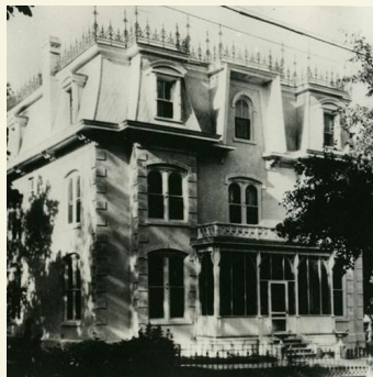
La Posada de Santa Fe (1882) Santa Fe, New Mexico