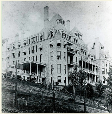
1886 Crescent Hotel & Spa (1886)