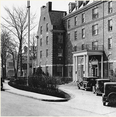
Hotel Viking (1926)