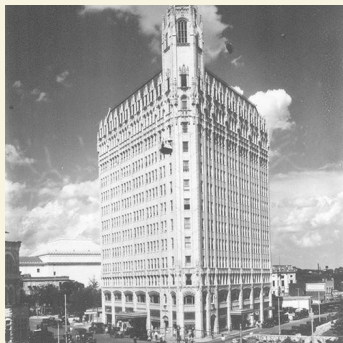
The Emily Morgan Hotel (1924) San Antonio, Texas

Looming majestically over the Alamo, The Emily Morgan Hotel is an iconic Texas landmark. Its intimidating gothic architecture, complete with rows of gargoyles, stirs the imagination. However, superstitious guests need not fear as this AAA Four Diamond historic hotel has taken every precaution, even eliminating its 13 th floor!