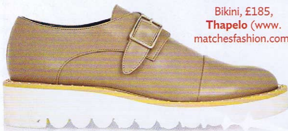
Bikini, £185, Thapelo ( www.matchesfashion.com )