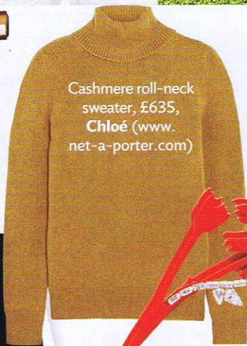
Cashmere roll-neck sweater, £635, Chloé ( www.net-a-porter.com )