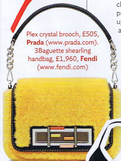
Plex crystal brooch, £505, Prada ( www.prada.com ). 3Baguette shearling handbag, £1,960, Fendi ( www.fendi.com )