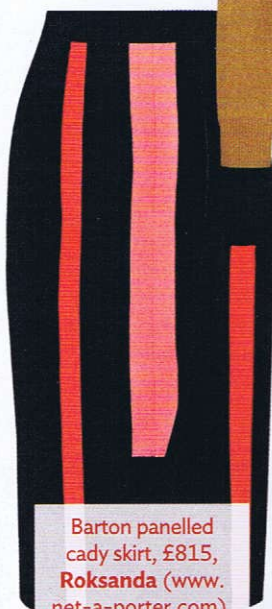
Barton panelled cady skirt, £815, Roksanda ( www.net-a-porter.com ). Loafers, £595, Stella McCartney ( www.net-a-porter.com )