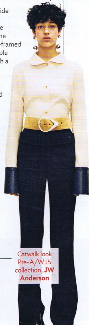
Catwalk look Pre-A/W15 collection, JW Anderson

With a spot-on location on the west side of Lake Como, here is a historic grande-dame hotel that would tickle Wes Anderson. Rooms are fantastically over the top with heavily swagged curtains, antique gilt-framed mirrors, velvet armchairs and bathrooms in marble from top to bottom. The best of the bunch come with a coveted balcony overlooking the still, deep waters. There are plenty of places to loll: the lakeside beach club across the road; a peaceful pool surrounded by pretty rose gardens; and the T Spa, which has teamed up with holistic pioneer ESPA. Inside the latter, all is contemporary and slick, with floor-to-ceiling windows overlooking the water and a wooden deck with sunbeds (time it so you're in the outdoor plunge pool for the last of the day's rays). There are also tennis courts, delicious wood-oven pizzas served under umbrellas on the stone terrace, and a sleek, Venetian-style boat for embarking on a private, guided tour. End the day in the main restaurant, La Terrazza, with a bowl of impeccable spaghetti vongole while looking out at the lights twinkling in Bellagio and Varenna, two must-visit cobbled towns on the other side of the water. EMMA LOVE Grand Hotel Tremezzo is a member of the Preferred Hotels & Resorts Legend Collection ( www.preferredhotels.com ). Doubles from £460