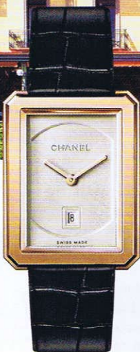
Boyfriend watch in gold, £8,100, Chanel ( www.chanel.com )