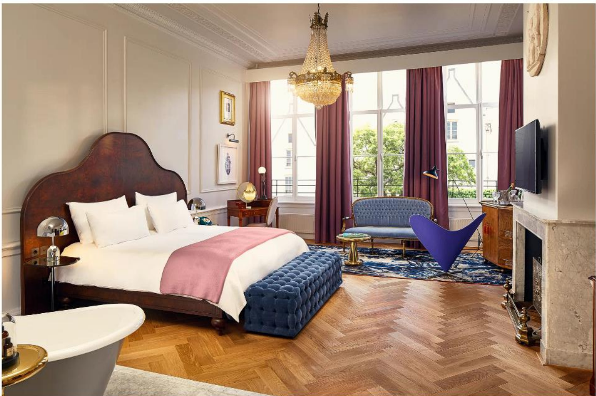
Lap of luxury: go all out in the Pulitzer Suite

Fusing history with hip Dutch design, this sleek hotel has plenty of character – not least because it's made up of 25 interlinked canal houses. Katie Gatens checks in