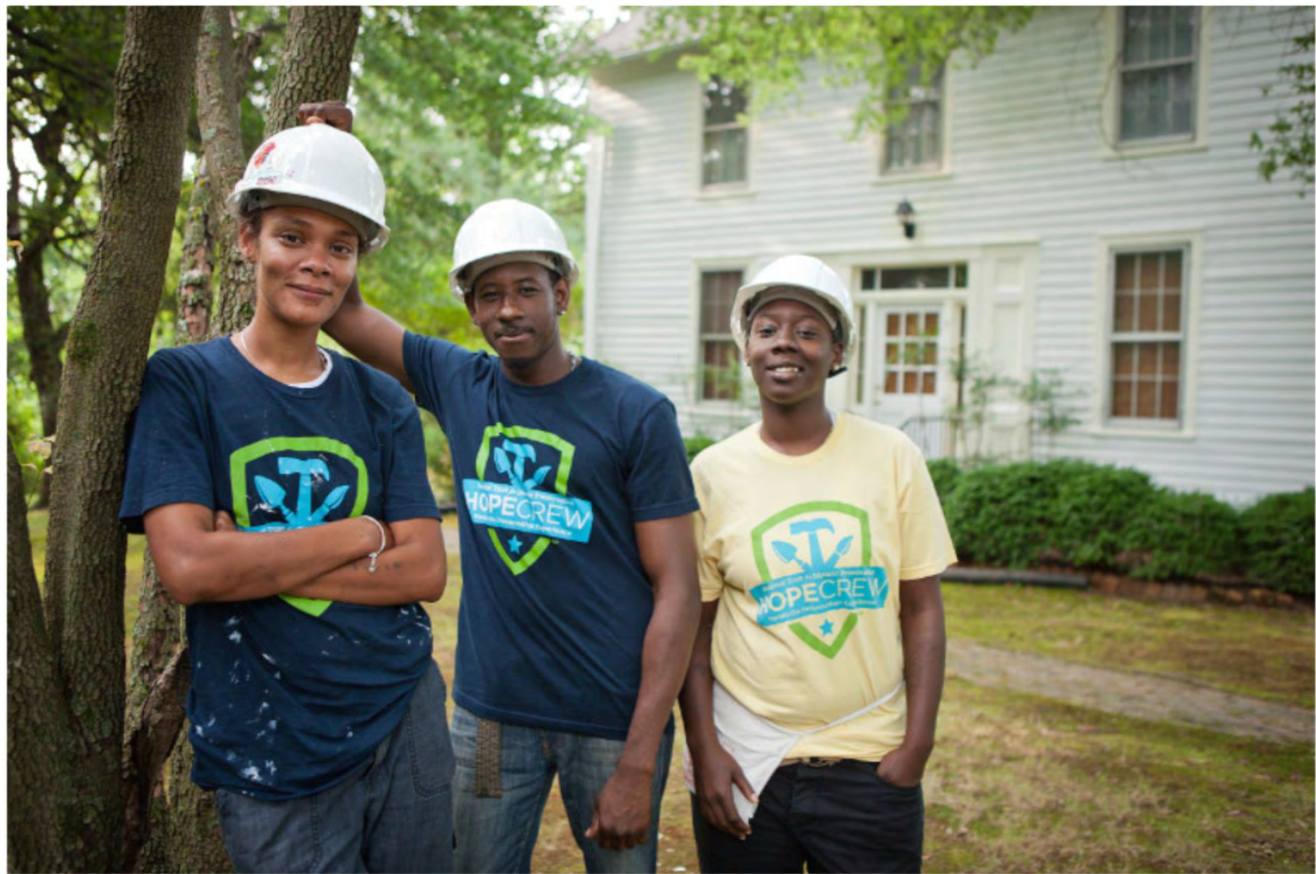
Woodlawn/Pope-Leighey: Alexandria, Virginia