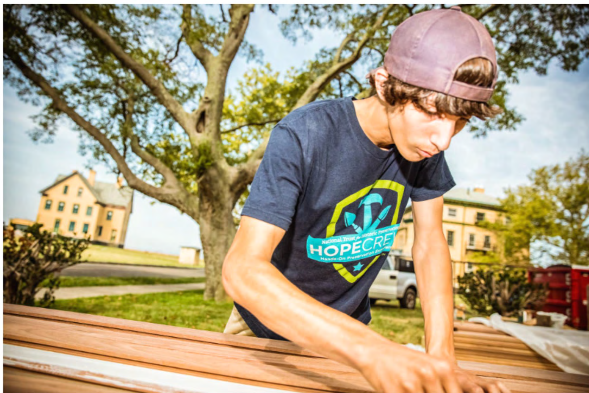
Gateway National Recreation Area: Sandy Hook, New Jersey