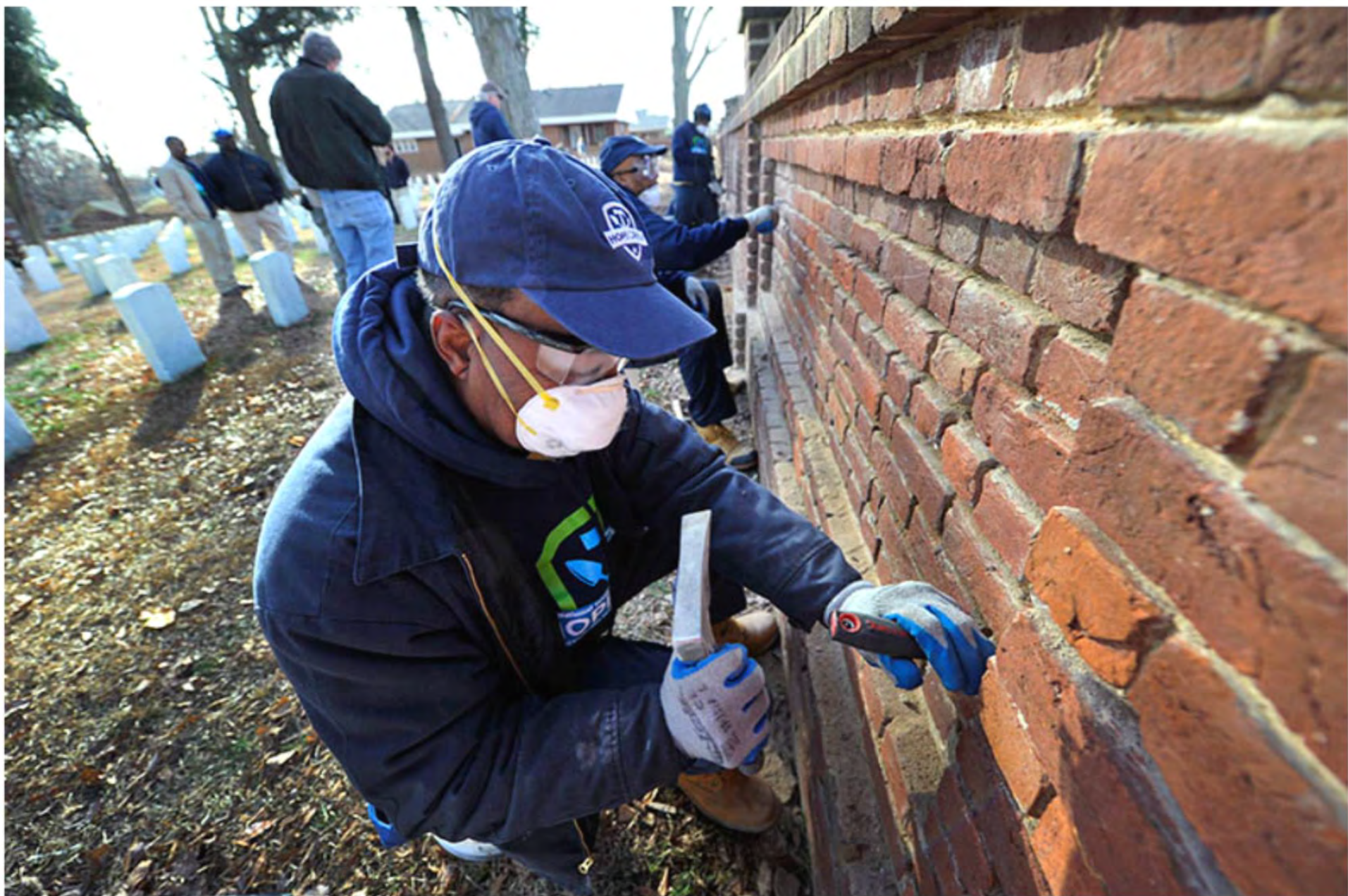
Raleigh National Cemetery: Raleigh, North Carolina