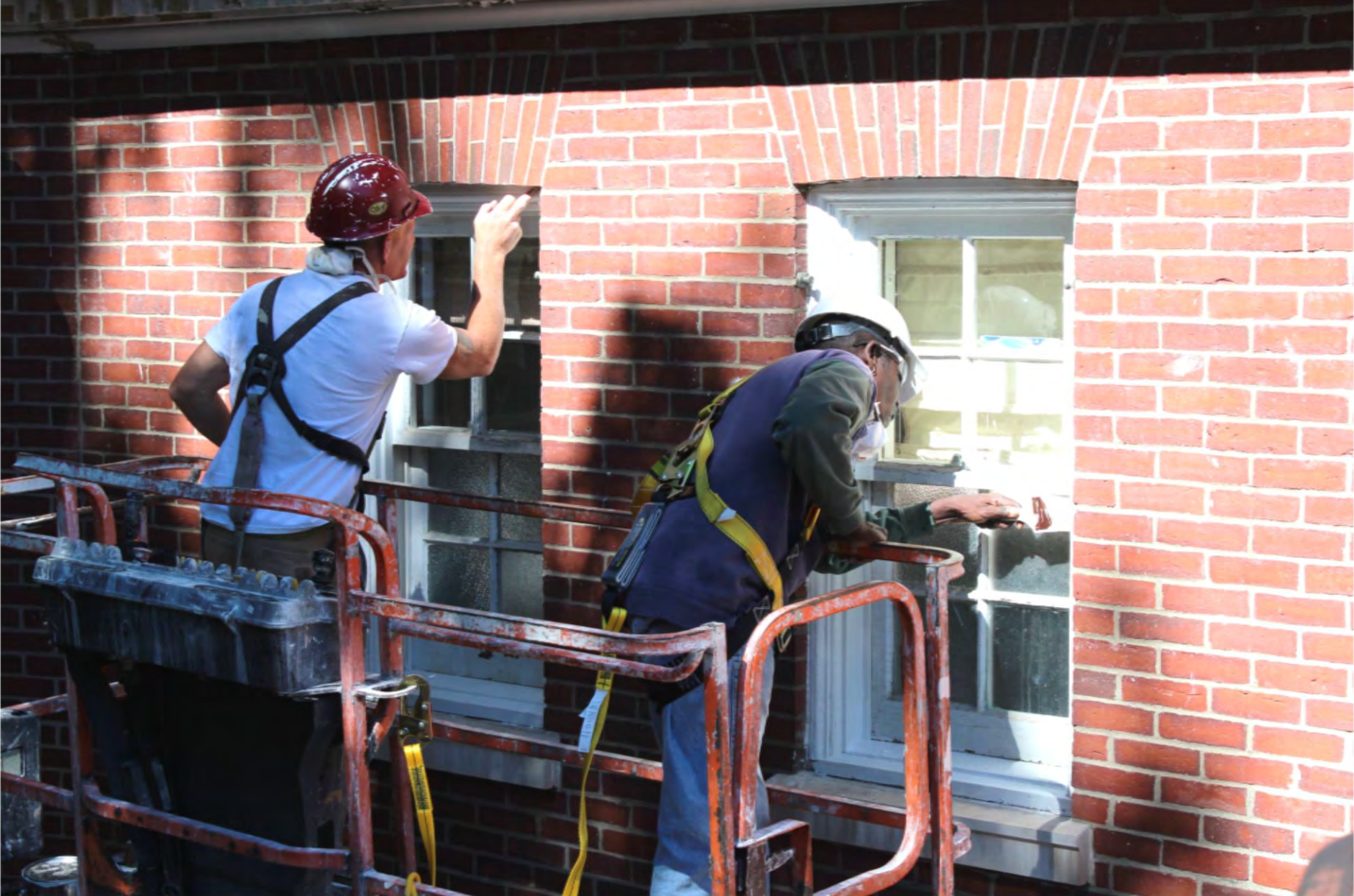
Gideon Putnam Hotel: Saratoga, New York