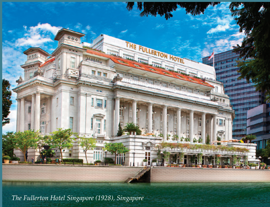
The Fullerton Hotel Singapore (1928), Singapore