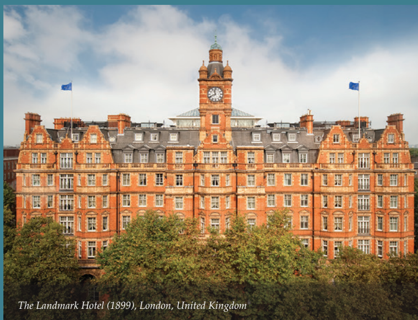
The Landmark Hotel (1899), London, United Kingdom