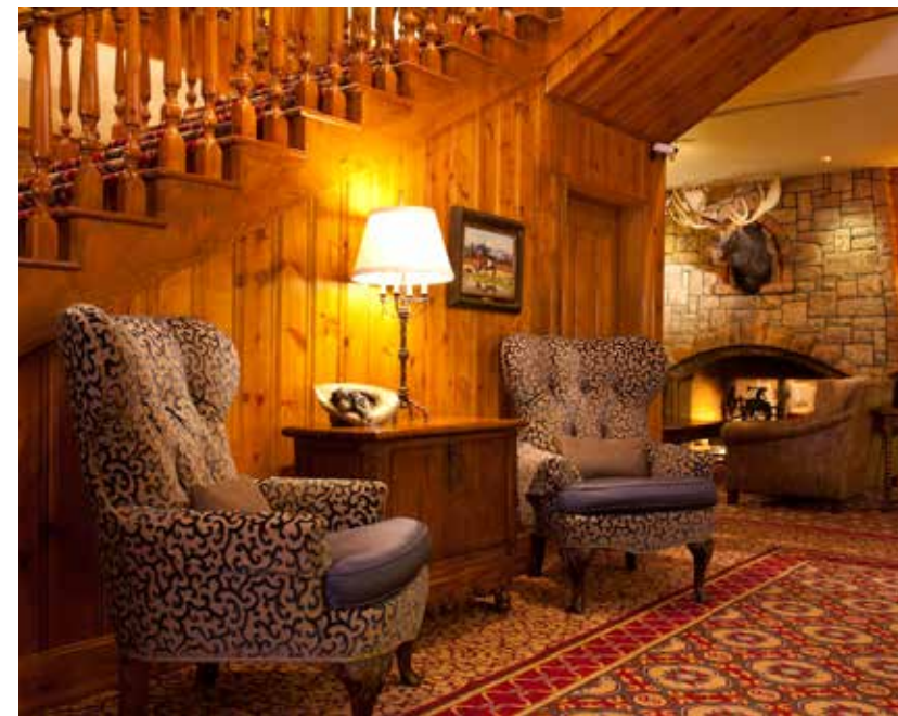
LEFT: JACKSON ROOM TABLE SETTING, SILVER DOLLAR SHOWROOM PRIVATE EVEN, JACKSON ROOM BANQUET RIGHT: CLYMER ROOM PRIVATE EVENT, LOBBY LOWER LEVEL