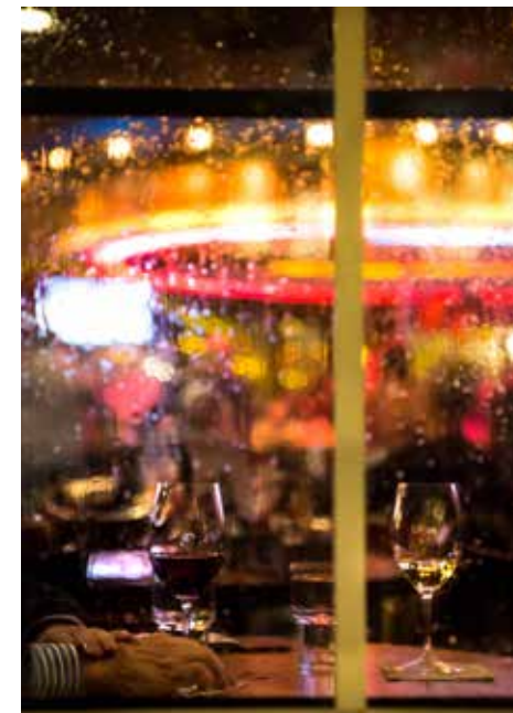
LEFT: PATIO SEATING, BARTENDER'S MARGARITA, HAPPY HOUR RIGHT: ONE TON PIG PERFORMS IN THE SHOWROOM, REGIONAL GAME PREPARED BY EXECUTIVE CHEF HAPPY HOUR DRINKS