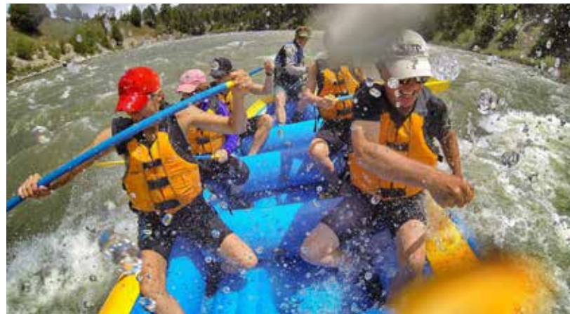
LEFT: FALL HIKING, SKIING AT JACKSON HOLE MOUNTAIN RESORT, WHITE WATER RAFTING RIGHT: GRAND PRISMATIC SPRING IN YELLOWSTONE, WINTER BUFFALO, GRAND TETON NATIONAL PARK