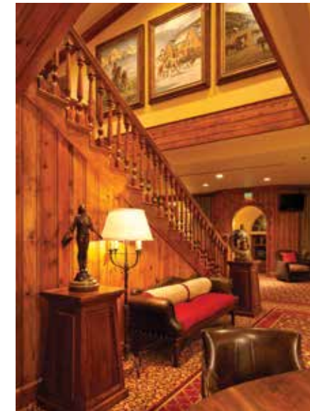
LEFT: GRAND TETON NATIONAL PARK, THE WORT HOTEL EXTERIOR, AWARDS RIGHT: LOWER LOBBY, TOWN SQUARE ANTLER ARCH, STREET VIEW, STAIRCASE