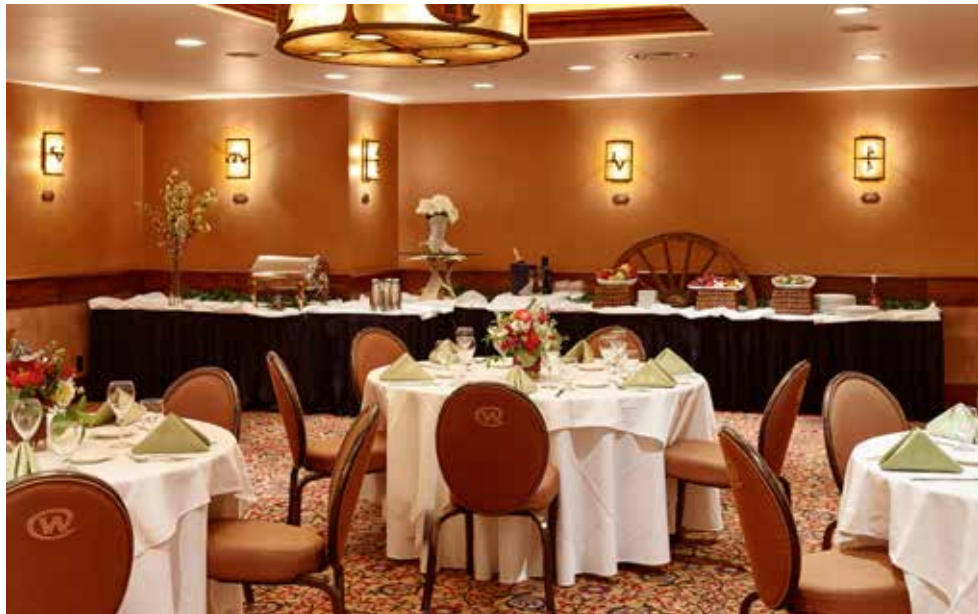
LEFT: JACKSON ROOM WEDDING RECEPTION, SILVER DOLLAR SHOWROOM RIGHT: CLYMER ROOM CUSTOM DOORS, GOLDPIECE ROOM, JACKSON ROOM WEDDING RECEPTION