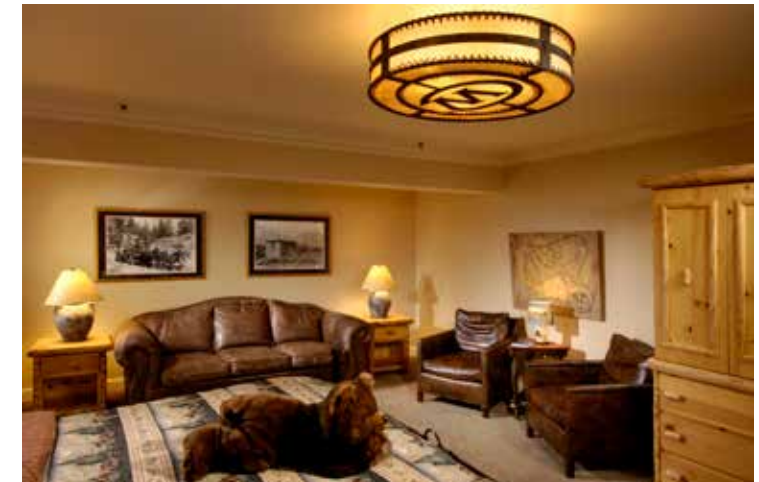
LEFT: COWGIRL SUITE, SILVER DOLLAR SUITE WITH WET BAR RIGHT: DELUXE ROOM WITH 2 QUEEN BEDS, JUNIOR KING SUITE, GRAND ROOM