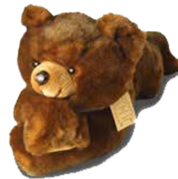
LEFT: FITNESS ROOM, ITEMS IN THE SILVER DOLLAR MERCANTILE, 75 YEARS OF HISTORY, "MEET ME AT THE WORT" BOOK, SILVER DOLLAR SAM TEDDY BEAR RIGHT: WORT HOTEL FRONT DOORS